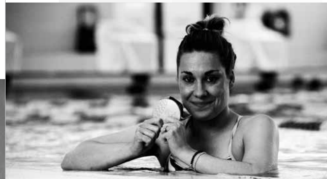
Our swimmers jumped in and took glory

This Materials Engineering graduate (1999) is now Chief Executive Officer for Kromek Materials, a company named as one of the '1000 Companies to Inspire Britain 2017' in a report by the London Stock Exchange Group.