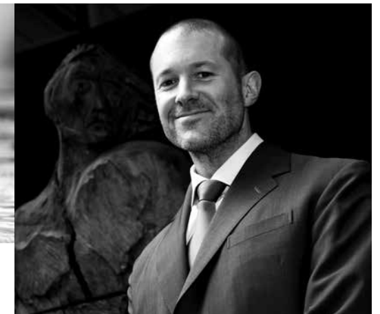
Sir Jonathan Ive KBE, CBE, Hon DCL Senior VP of Design - Apple

Our students and alumni secured six medals at the Rio 2016 Paralympic Games. If Northumbria was a country, we would have been 51st in an overall medal table, ahead of the Czech Republic.